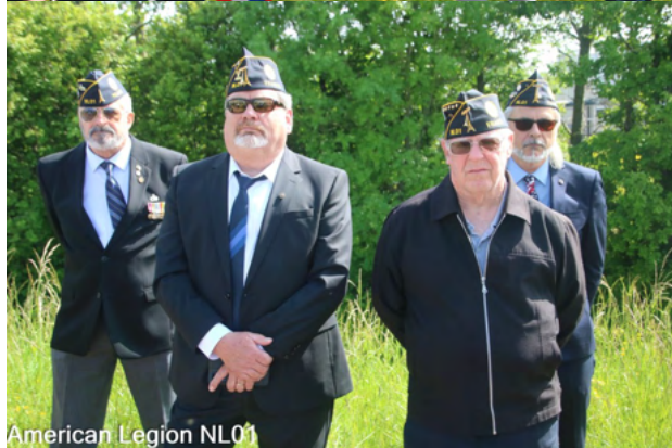
American Legion NL01