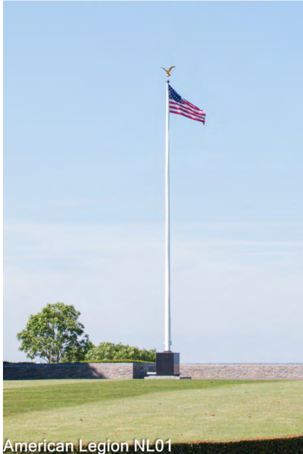
American Legion NL01