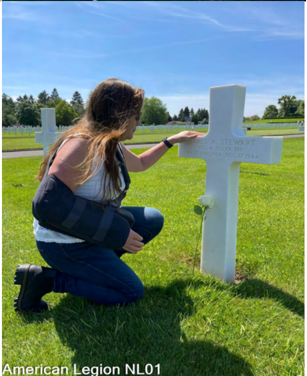
American Legion NL01