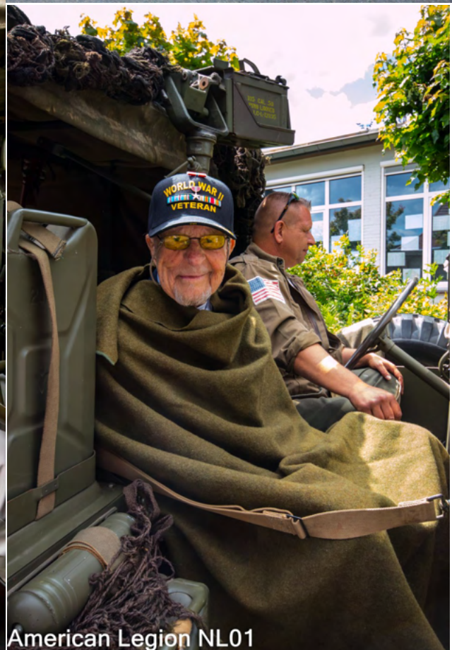
American Legion NL01