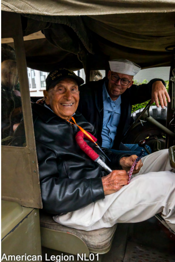
American Legion NL01