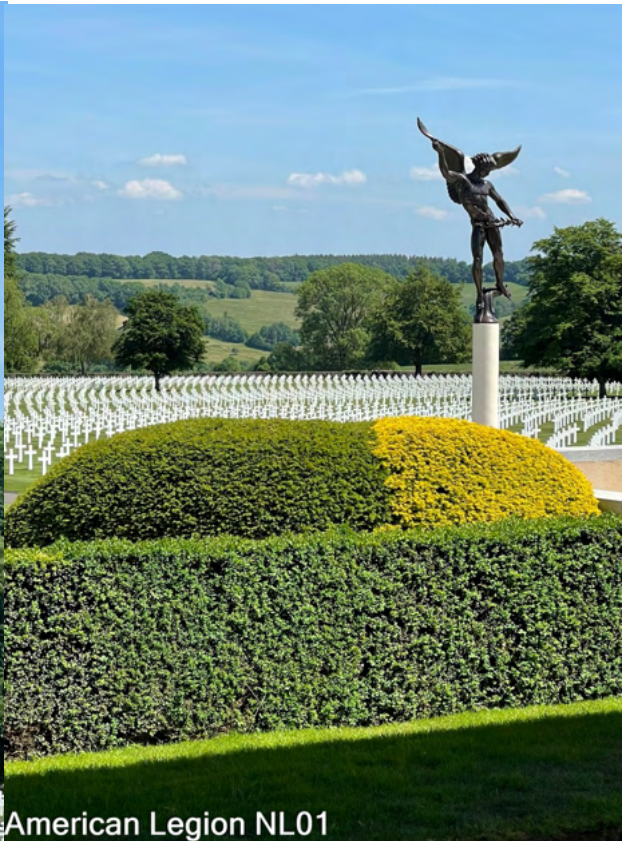
American Legion NL01