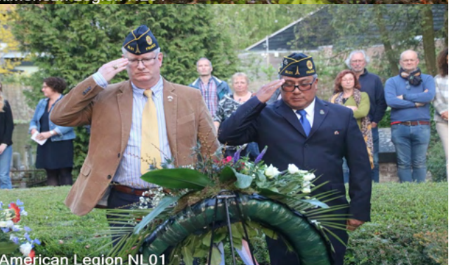
American Legion NL01