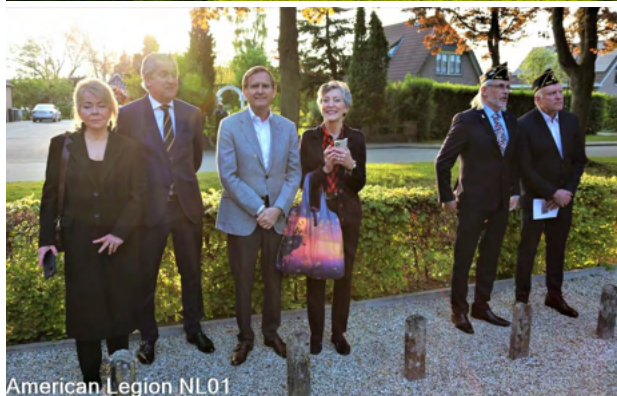
American Legion NL01