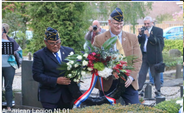
American Legion NL01