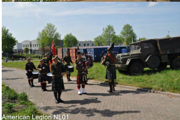
American Legion NL01