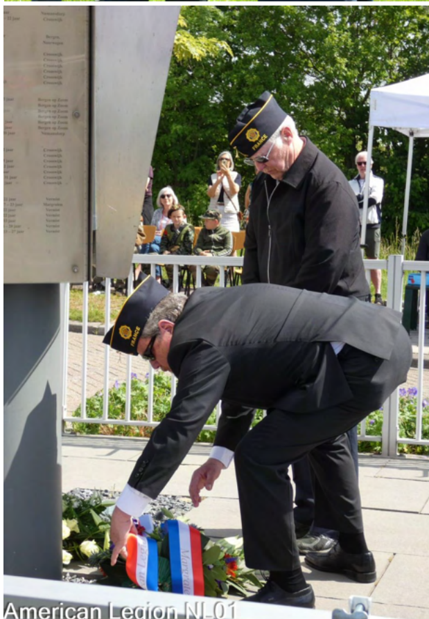
American Legion NL01