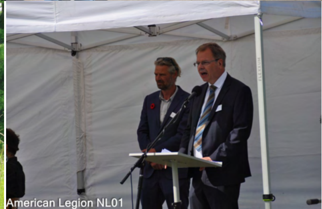
American Legion NL01