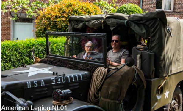
American Legion NL01