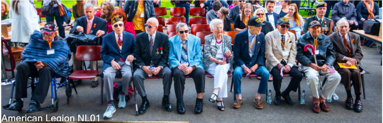
American Legion NL01