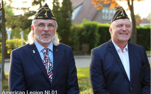
American Legion NL01