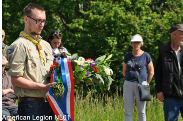
American Legion NL01