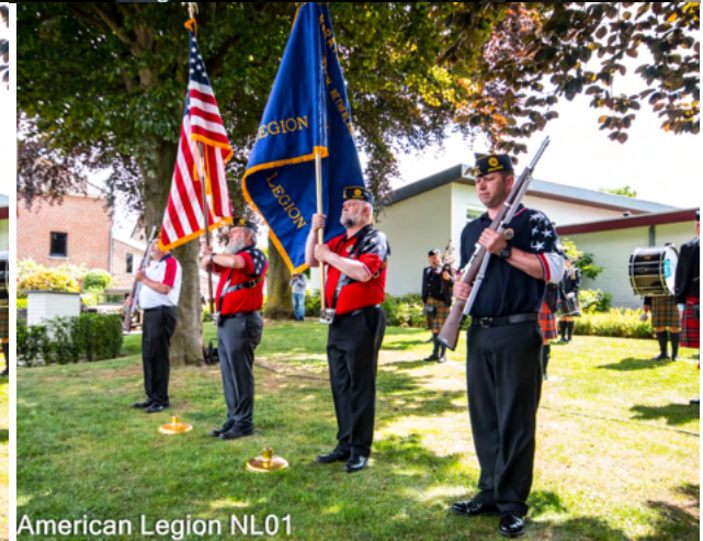
American Legion NL01