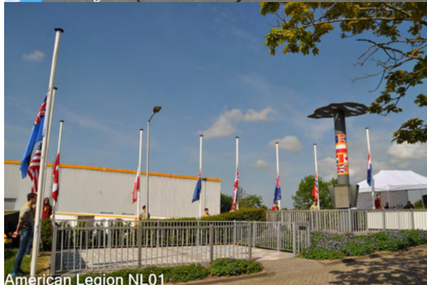
American Legion NL01