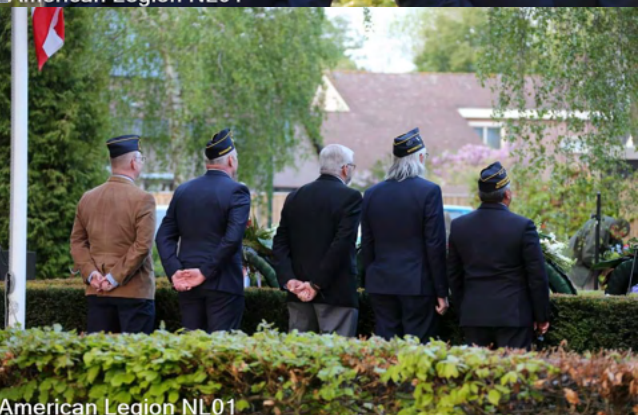
American Legion NL01