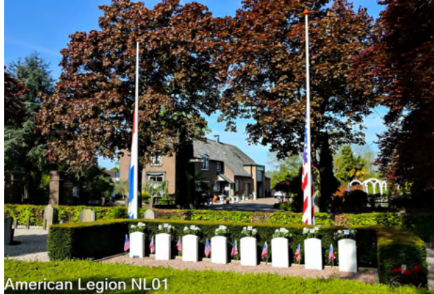
American Legion NL01